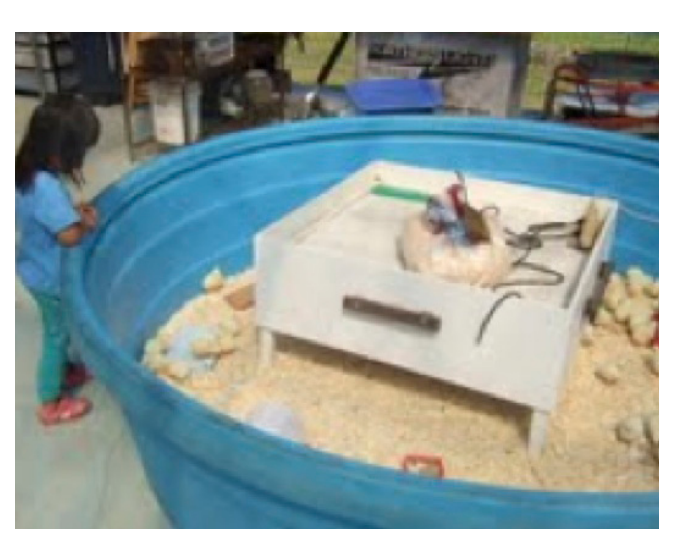
Figure 1. Brooder

Making a brooder and setting it up: The brooder can be made from a large cardboard box, plastic tote/storage