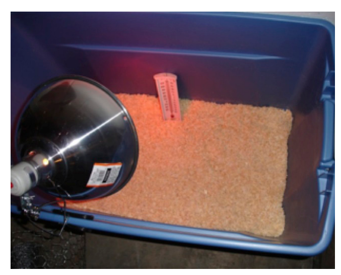
Figure 2. Heat source

The heat source: The brooder ought to be heated to prevent chilling when raising baby chicks. A simple solution is a standard heat lamp with a 250-watt bulb and a thermometer (see Figure 2). The temperature for baby chicks' first week after hatching should be approximately 95 degrees; gradually decrease the temperature by 5 degrees for each week thereafter. To accomplish this, hang the heat lamp centrally over the top of the