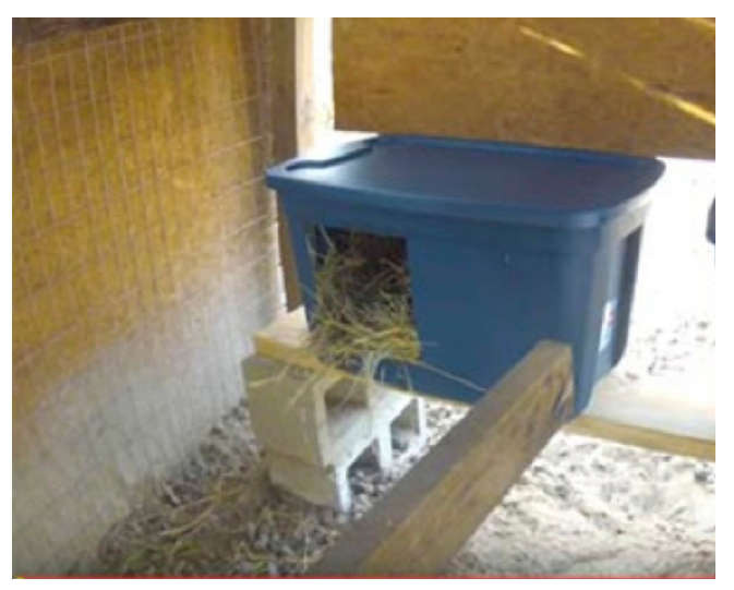
Figure 4. Homemade layer box