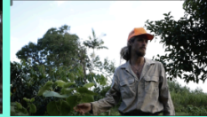
Moose & Mimi